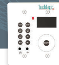
CPS-120 Remote Control Package