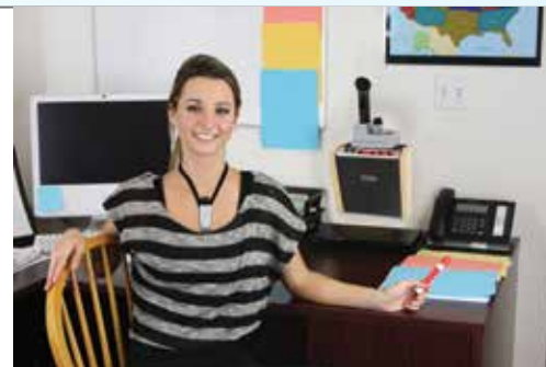
Result: Another happy teacher with an organized classroom