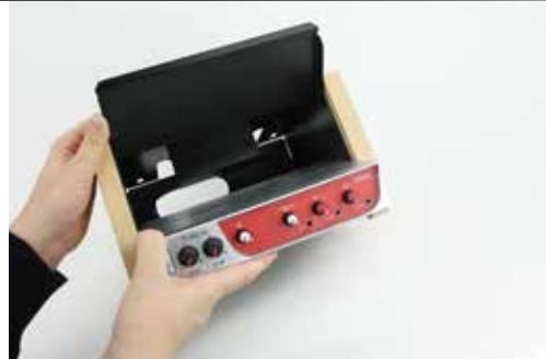
Forum232, Maxim III, Spectrum III or VoiceLink III easily drop into place